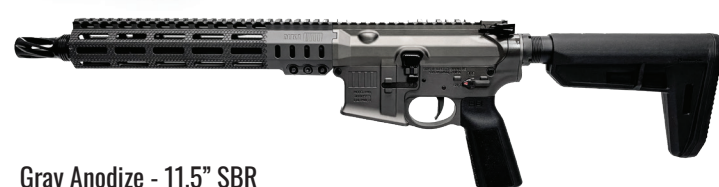
Gray Anodize - 11.5" SBR