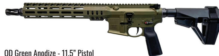
OD Green Anodize - 11.5" Pistol