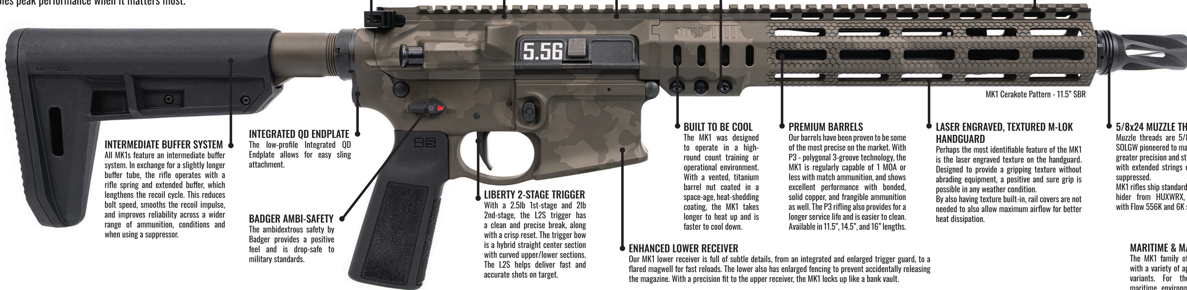
MK1 Cerakote Pattern - 11.5" SBR

With a built-in deep cable management channel, profiled rail slots, and laser etched, hexagonal texturing, the MK1 Rail is a signature feature to the MK1 rifle. Cables may be routed through the channel to prevent snagging and excessive use of zip-ties. All of the rail slots have been chamfered and relief cut to minimize damage to cables. The cable management channel runs from the front of the handguard to the rear of the upper receiver, maximizing flexibility.