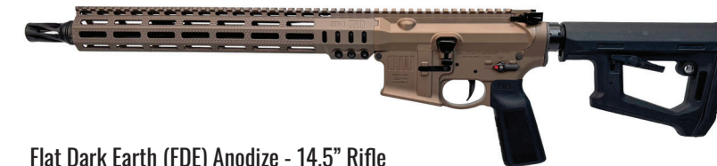
Flat Dark Earth (FDE) Anodize - 14.5" Rifle