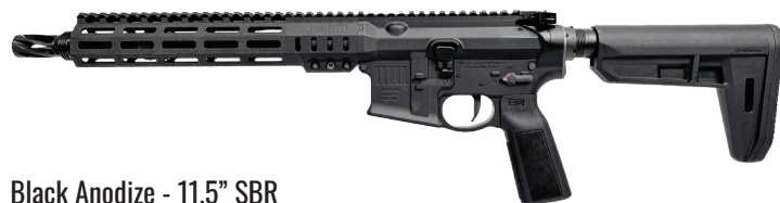
Black Anodize - 11.5" SBR

FINISH FOR ANY FLAVOR The MK1 is available in a variety of finishes, including black, gray, OD Green and FDE anodizing; as well as Cerakote single colors and the MK1 signature pattern.