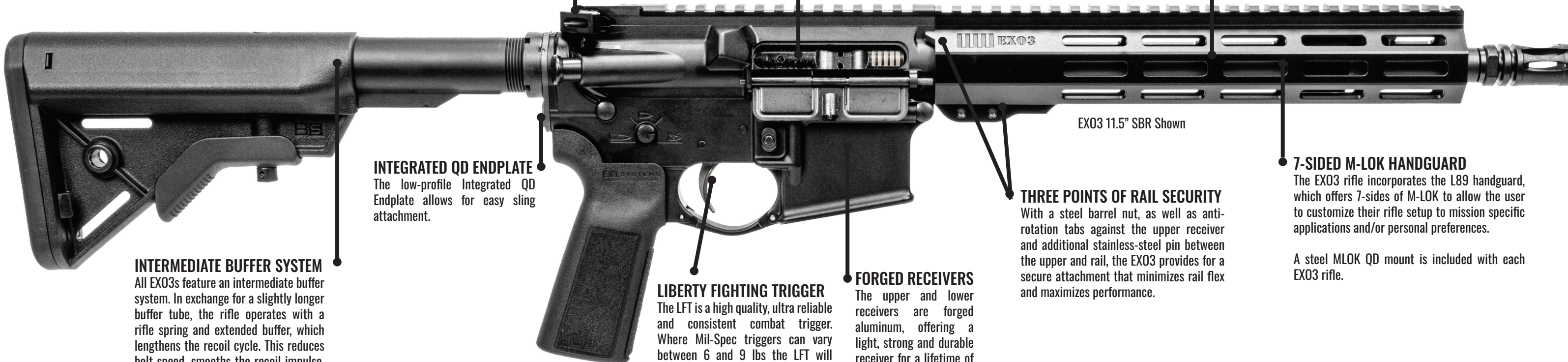
EX03 11.5" SBR Shown

The Sons of Liberty Gun Works EX03 offers a reliable, duty-grade rifle, with only the essential features needed in a fighting rifle. Like all SOLGW rifles, the EX03 reflects an attention to detail in material selection, part construction and build quality that is second to none. The result is a rifle that delivers exceptional shootability and unmatched dependability, whether on the job, at the range, or in defense of the home.